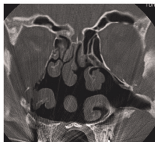
A: before recovery