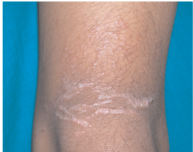
Figure 1. Lichen planus-like cutaneous lesion: multiple violaceous papules over the lower part of the left anterior thigh and also over the patellar region. The lesions were discrete as well as confluent in linear fashion in parallel rows mimicking lichen planus.

Histopathology with hematoxylin and eosin stain revealed a dense perivascular accumulation of mononuclear cells immediately beneath the dermoepidermal junction underneath an acanthotic epidermis with tapering rete ridges (Figure 2). Focally, a few mononuclear cells were seen infiltrating the basal layer, and vacuolar change of the basal layer was not seen. Perivascular sparse infiltrate was also seen in the deeper portion of the dermis and the subcutis was normal.