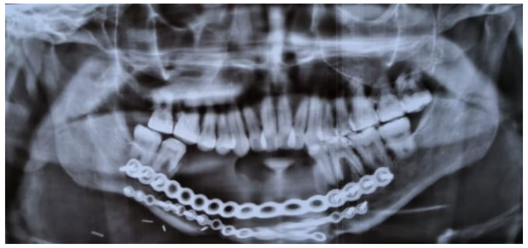
Fig. 3 Orthopantomogram depicting segmental resection of anterior mandible reconstituted with reconstruction plates

Endodontic treatment was performed with respect to tooth 36 under rubber dam and local anesthesia, and 3% sodium hypochlorite (Vishal Dentocare Pvt Ltd, India) was used as irrigant. The working length was obtained using hand K file (Dentsply Inc, Maillefer, Dentsply India), Root ZX II Apex locator (Morita, Irvine, CA), and finally confirmed using intraoral periapical radiograph. Cleaning and shaping of all the canals were performed with hand K files and Protaper rotary files (Dentsply Inc, Maillefer, Dentsply India) under copious irrigation with 3% sodium hypochlorite and enlarged up to F2 file size. Two rounds of triple antibiotic paste (TAP) as intracanal medicine (3Mix-MP), which is a combination of metronidazole, minocycline, and ciprofloxacin in the ratio of 1:1:1, was applied to tooth 36 for a period of 1 week. Triple antibiotic paste has the capacity to sterilize the pulp space from all microbes and also has regeneration