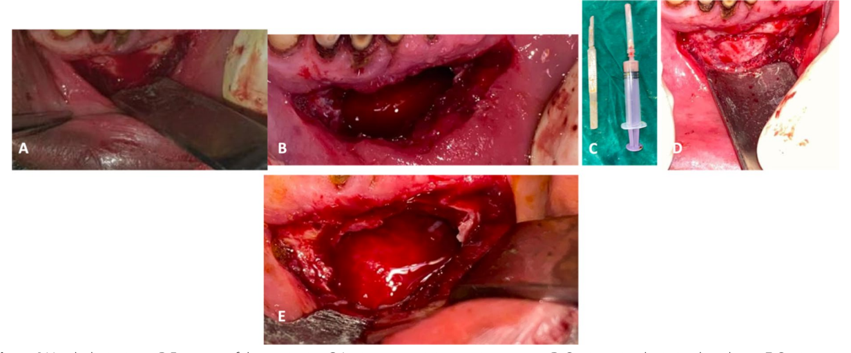
Fig. 1 A Vestibular incision. B Exposure of the cystic site. C Aspirate containing cystic contents. D Cystic cavity depicting bare bone. E Cystic cavity showing cystic lining

Radiographic examination included full mouth orthopantomogram (OPG) and intraoral periapical radiograph (IOPA) of tooth 36. A panoramic radiograph (OPG) was