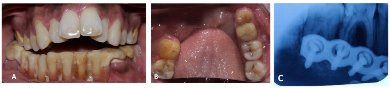
Fig. 2 A Maximum intercuspation with the removable prosthesis. B Mandibular occlusal view with tooth of interest (36). C IOPAR depicting deep restoration