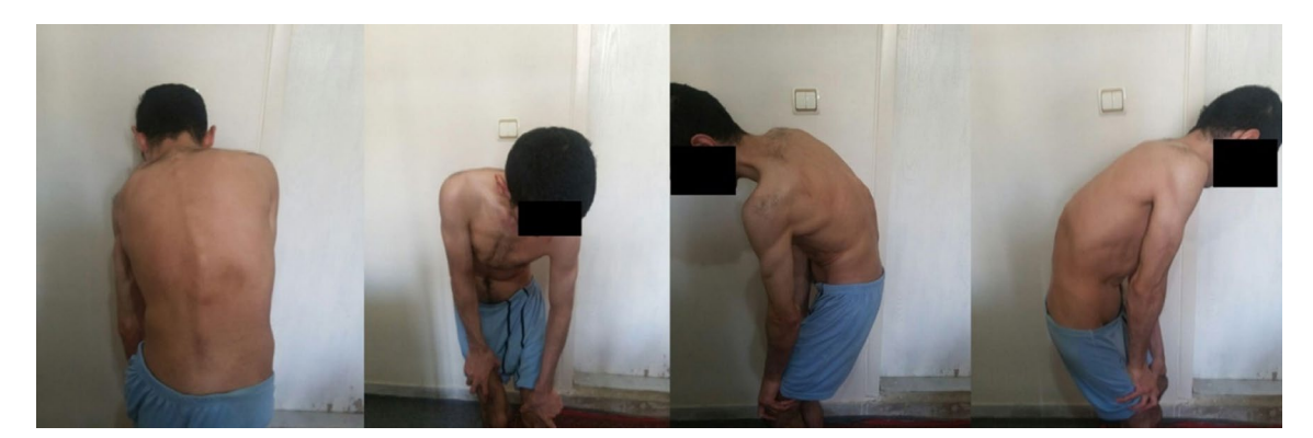
Fig. 1 Patient presentation before the kyphoscoliosis correction surgery