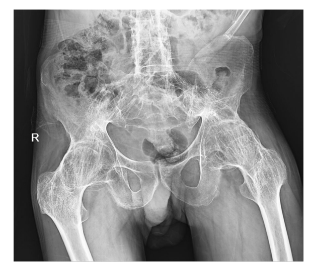
Fig. 2 Initial pelvic plain radiograph revealed bilateral fused hips and bamboo spine

In according to the potential surgical and anesthetic risks associated with performing total hip arthroplasty (THA) in patients diagnosed with AS, a comprehensive consultation with the patient led to the decision to choose a one-stage conversion of bilateral hip fusion to THA. To optimize the surgical procedure, the direct anterior approach (DAA) was chosen as the preferred method. In preparation for this conversion, the patient was initially referred to a spine specialist to address the underlying spine deformity, thereby enabling the patient to assume a supine position during the THA procedure. After nine