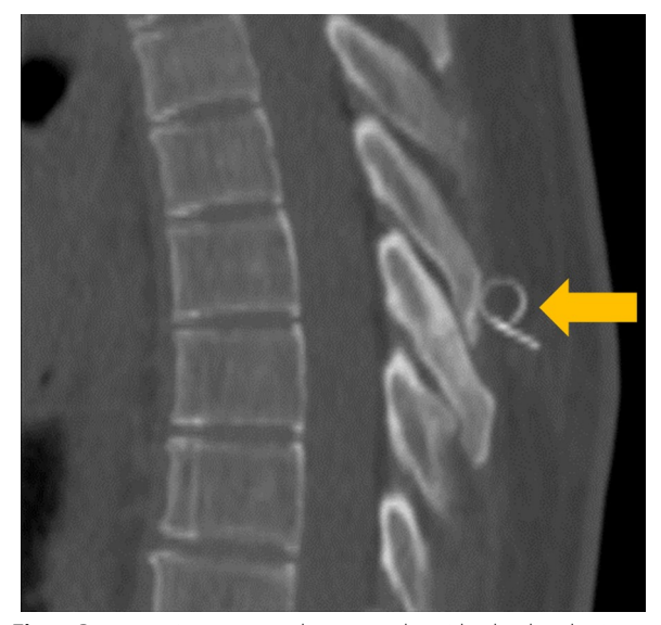
Fig. 4 Pre-operative computed tomography with a landmark wire (gold arrow) to ensure the correct vertebral level

back pain ranging from 0/10 to 2/10 on the VAS. Clinical examination revealed no pain on palpation and a full, painless range of motion of the trunk.