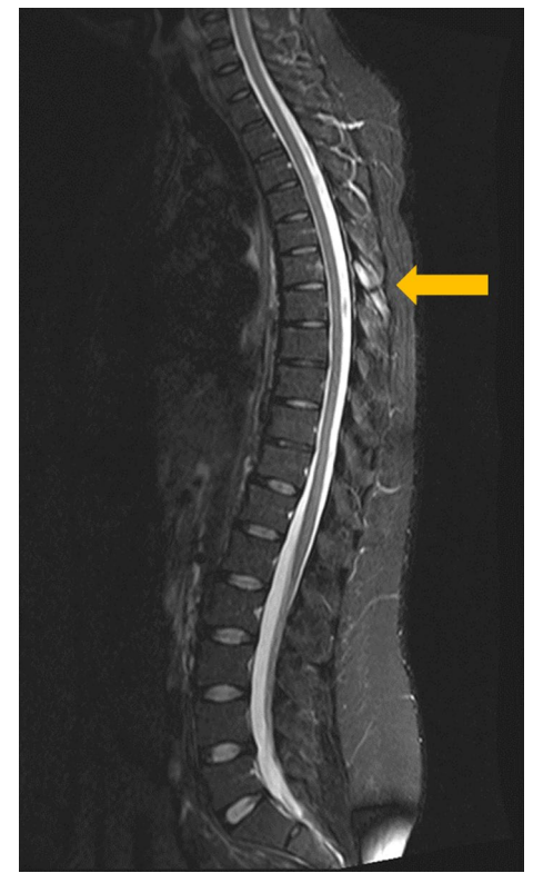
Fig. 2 Short tau inversion recovery sequence magnetic resonance imaging sagittal view showing an isolated T6 nonunion (gold arrow) 2 years after the fracture