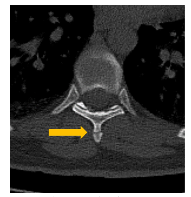
Fig. 1 Computed tomography axial view showing a T6 spinous process nonunion (gold arrow) 2 years after the fracture

The postoperative course was uncomplicated. The nonunion was confirmed after histological examination of the fragment, which concluded that reactive fibrocartilage was present. After 6 weeks the patient was able to return to work and his usual daily activities without any limitation. Six months after surgery he did not complain of any limitation and reported intermittent mild upper