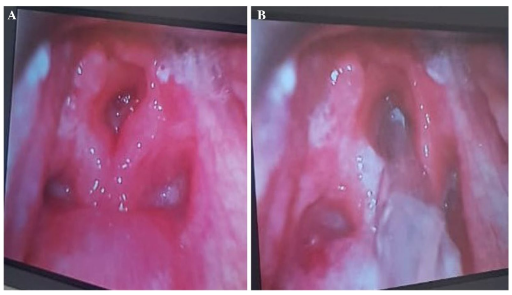
Fig. 1 A Video laryngoscopy showing erythema redness and swelling around epiglottis, aryepiglottic fold and surrounding laryngeal mucosa. B Interval placement of endotracheal tube