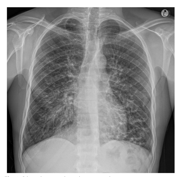
Fig. 3 Bilateral massive bronchiectasis with cystic appearance in the middle and lower fields, possibly related to recurrent episodes of bronchopulmonary infection

Upon follow-up 6 months later, the patient reported his general condition since enrollment as improved. He reported intermittent shortness of breath, dry cough, and tiredness. The previous 7 days, however, were symptomfree. Since enrollment in the TB TRIAGE + ACCURACY study, the patient has sought no medical care, and there is no treatment or future care planned.