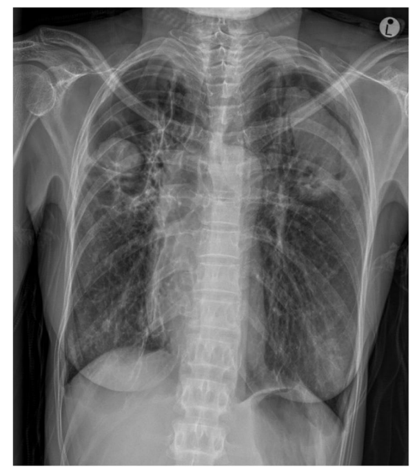
Fig. 4 Cavitation in right and left upper fields with solid content, potentially fungus balls/aspergillomas. Bilateral pleural thickening. No sign of infiltrates or pulmonary edema

was apyrexial and comfortable on room air with SpO<sub>2</sub> of 98%, and her vital signs were within normal range with a respiration rate of 18 beats per minute. Her chest findings were equal chest expansion, hyperresonance to percussion bilaterally, air entry heard bilaterally but slightly decreased on the right posteriorly, and bilateral amphoric breath sounds with intermittent wheezing. The SARS-CoV-2 PCR and Xpert MTB/RIF and Xpert MTB/ RIF Ultra assay results were negative. The TB LAM Ag Test, which detects the LAM antigen in urine, indicating active TB, was positive (1+). The capillary blood sample displayed neutrophilic leukocytosis with neutrophil levels at 76% (normal range 40-60%) and a total leukocyte count of 19.3 \times 10^{9} /L (normal range 4.0-10.0 \times 10^{9} /L). The CRP level was elevated at 53 mg/L. CD4 level was tested higher than 200 cells/µL. The PA-CXR revealed cavitation with solid content in the right and left upper field, in addition to bilateral thickening of the pleura, highly suspicious for aspergillomas (Fig. 4; CAD4TB v7 score: 61.7). The patient was called back the following week for an additional sputum and urine Xpert MTB/RIF Ultra, both without detection of Mycobacterium tuberculosis (MTB). The patient was then referred to the hospital outpatient clinic where the patient was known for many years.