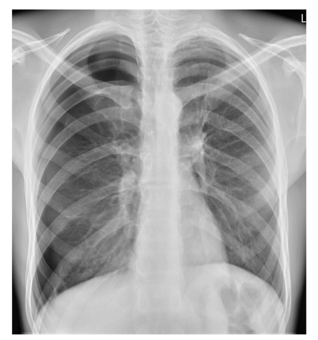
Fig. 2 Pneumothorax on right side. No sign of a significant mediastinal shift and thus no evidence of tension pneumothorax. No infiltrate

A African young man of 28 years and a body mass index (BMI) of 19 kg/m<sup>2</sup> presented for TB screening at Butha-Buthe District Hospital, Lesotho with a productive cough, chest pain, and night sweats starting 3 days prior to presentation. Other exhibited symptoms included fatigue, a sore throat, and rhinorrhea. No fever was reported. He reported no history of TB, previous lung disease, or other comorbidities. On presentation, the patient had a stable cardiorespiratory status, with all vital signs and oxygen saturation within normal range. On clinical examination, there were no signs of edema, dehydration, or enlarged lymph nodes. The SARS-CoV-2 PCR, Xpert MTB/RIF and Xpert MTB/RIF Ultra assays, as well as the TB LAM Ag Test all returned negative. The PA-CXR conducted at Butha-Buthe District Hospital revealed no signs of infiltration or pleural effusion, but a right-sided pneumothorax (Fig. 2; CAD4TB v7 score: 35.54). Hospital admission and intercostal drain placement were recommended as procedure by the study team. The hospital physician, however, opted for a conservative therapy. On the followup CXR, the pneumothorax had resolved spontaneously. The patient was in a stable state and was therefore discharged from the hospital.