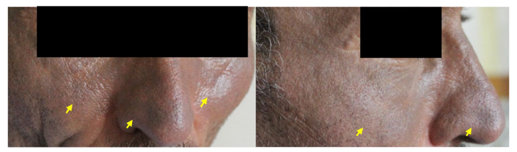
Fig. 1 Blue man syndrome. Blue-gray discoloration on cheek and nose (yellow arrow)

chlorpromazine, chloroquine, and hydroxychloroquine, may also cause some level of blue-gray discoloration. Furthermore, it has also been observed in argyrosis, methemoglobinemia, and ochronosis [5].