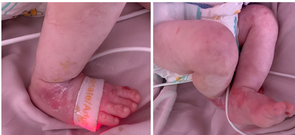
Fig. 1 Patient's feet with erythematous patches and bullous eruptions on dorsal surface of toes

He was brought to the pediatrics center with apnea and respiratory distress, was intubated on the emergency ward, and then admitted to the pediatric intensive care unit (PICU). His symptoms started 4 days before the admission with vomiting and poor feeding, for which a primary care physician prescribed antibiotics as outpatient therapy. After intubation and resuscitation, physical examination revealed a pulse rate of 154 beats per minute, respiratory rate of 70 per minute, temporal temperature of 36.5 °C, nondetectable blood pressure, and oxygen saturation of 96%. His body weight was 3700 g. He had a tense 1.5 × 1.5 cm 2 fontanel, reactive normal-sized pupils that subsequently became miotic and nonreactive, and subcostal and suprasternal retraction. Heart sounds and abdominal examination were normal. There were multiple bolus eruptions all over the body but not in mucosal membranes (Fig. 1). Laboratory investigations showed white blood cell count of 41,000/mm 3 with 68% neutrophils and 26% lymphocytes, hemoglobin of 10.8 g/dL,