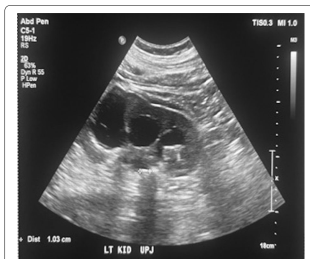
Fig. 1 Renal ultrasound showing an obstructive 1-cm calculus at the left UPJ, causing moderate to severe hydronephrosis

His blood chemistry showed a serum creatinine level of 14.1 mg/dL, increased from his baseline level of 1.6 mg/dL, and a blood urea nitrogen (BUN) level of 57 mg/dL with a BUN-to-creatinine ratio of 4.04. Urinalysis showed microscopic hematuria. Chest radiography revealed mild pulmonary edema. His hemoglobin level was 13 g/dL. He was managed with intravenous labetalol (10 mg), oral carvedilol (25 mg), and oral hydralazine (25 mg), which slightly decreased his high blood pressure by approximately 40 mmHg for his systolic blood pressure (SBP) and 10 mmHg for his diastolic blood pressure (DBP). A straight catheter was inserted, with no urine flow noted. Furthermore, a bladder scan was performed, which