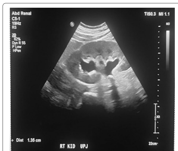
Fig. 2 Renal ultrasound showing an obstructive 1.4-cm calculus at the right UPJ, causing moderate hydronephrosis

showed no urine in the bladder. An ultrasound of the kidneys showed bilateral UPJ obstruction from bilateral obstructing nephrolithiasis measuring 1.4 cm at the right UPJ and 1 cm at the left UPJ, causing moderate right and severe left hydronephrosis (Figs. 1, 2). Furthermore, fluoroscopic retrograde urography showed a dilated right and left renal pelvis with filling defects consistent with calculi noted on ultrasonography (Fig. 3).