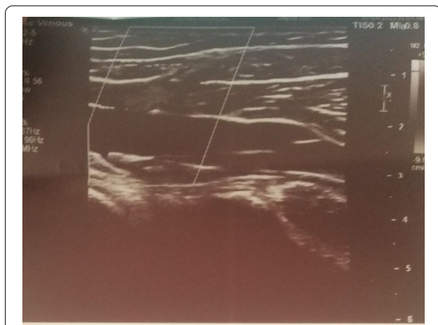
Fig. 1 Doppler of proximal end of Superficial Saphenous Vein