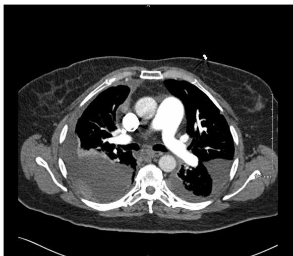
Fig. 1 Computed tomography of the chest showing the large bilateral pleural based nodularities

both lungs and pleura were suspicious for metastatic disease.