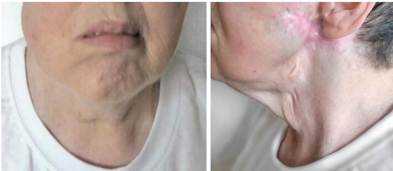
a: Picture after therapy with clofazimine.