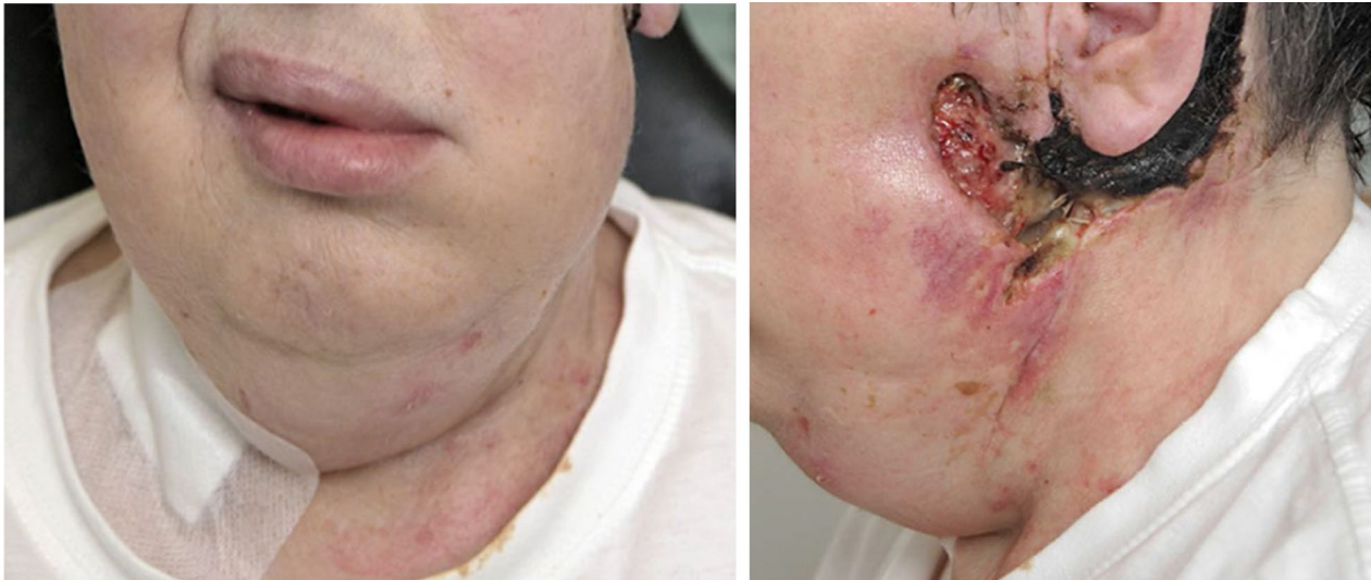
a: Clinical features of MRS with swelling of the lower lip, and left-sided facial paralysis.