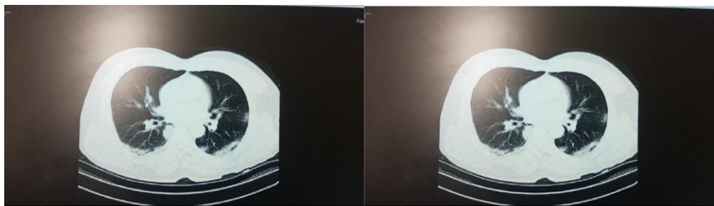
Fig. 1 Lung high-resolution computed tomography

\text{PCO}_2 partial pressure of carbon dioxide, \text{HCO}_3 bicarbonate, RT-PCR reverse transcription polymerase chain reaction