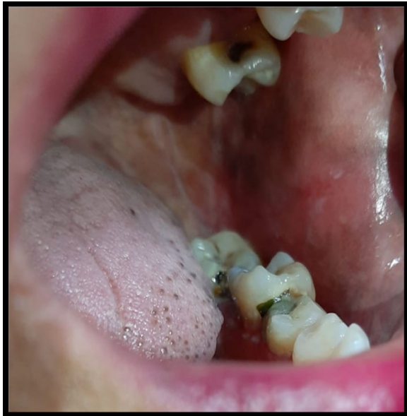
Fig. 2. Typical Wickham striae in the posterior part of the buccal mucosa