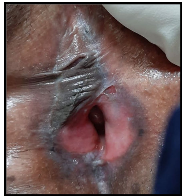
Fig. 1. Erosive lichen planus of genitalia showing white striae and marked reduction of the vagina