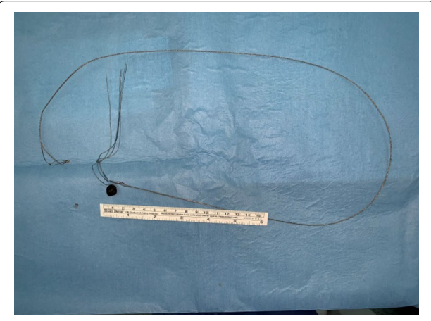
Fig. 4. The retrieved basket with the stone

a prophylactic gastroenterostomy was performed as a protection, to prevent leakage from the CBD and the duodenum. The postoperative course was satisfactory; the patient recovered well from the surgery, and was discharged at 7 days postoperative. A 6-month follow-up was satisfactory without complications.