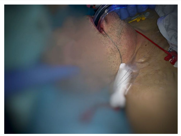
Fig. 2. The cut edge of the basket handle can be seen emerging from the mouth, following failed removal of the basket