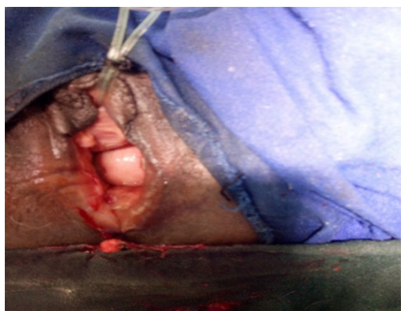
Fig. 4 After apical repair with right sacrospinous ligament fixation