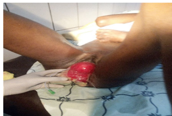
Fig. 2 Stented right ureter