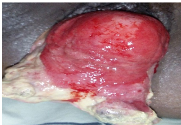
Fig. 1 Edematous and infected ruptured bladder at admission

Six weeks after the RSSF the ruptured bladder was repaired after adequate mobilization of the bladder