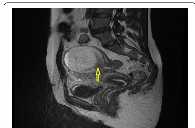
Fig. 2 Pelvic magnetic resonance imaging in T2 sagittal section showing hypersignal of the cyst with a solution of continuity of its wall (arrow)