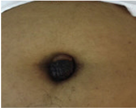
Fig. 1 Hyperpigmented umbilical nodule