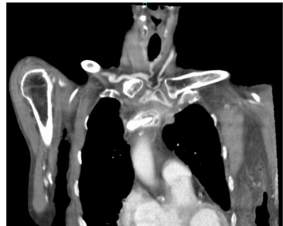
Fig. 2 Chest computed tomography scan (coronal)

hospital admission showed that the abscess cavity had shrunk and that there was no infection recurrence. The patient was subsequently followed up at our hospital for about 1 month.