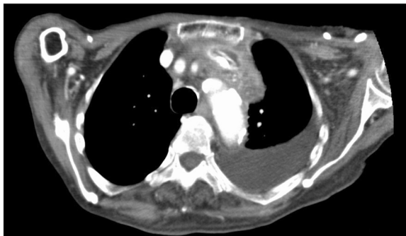
Fig. 1 Chest computed tomography scan (axial). The catheter tip was located within the lumen of the left brachiocephalic vein, but there was a high absorption area around it with some air density

The patient was hospitalized and started on antibiotics (cefmetazole 1 g every 8 hours). Bacterial culture of a blood sample collected on the day of hospitalization revealed multidrug-resistant Serratia marcescens , so the antibiotic was changed to meropenem (1 g every 8 hours) for a total of 15 days. The patient's clinical course was uneventful, her fever subsided, and the inflammatory response improved. Chest CT performed 20 days after