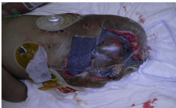
Fig. 4 Negative-pressure wound therapy was applied

successfully treated by ligation. In parallel with the increasing number of TAE procedures performed for pelvic fracture, there has been an increase in the number of complications caused by TAE of the internal iliac artery, including gluteal skin and muscle necrosis, dysfunction of the bladder and rectum, and sexual dysfunction. Our patient was referred to our plastic surgery department due to the presence of blisters on his bilateral thighs and scrotum, which were thought to be complications caused by TAE of the bilateral internal arteries. These blisters were evident at our first consultation. In addition, his limbs were pale and contrast CT showed ischemia of his lower limbs. Rapid amputation of his bilateral limbs was inevitable to prevent the progression of necrosis and infection. The bilateral limbs were amputated in separate procedures because the amount of blood lost in each operation could have easily exceeded 2000 ml and our patient could not have tolerated such a prolonged surgery. We needed to perform several debridement procedures because of the massive hemorrhage, which placed a tremendous burden on our patient; the amount of nonviable tissue that needs to be debrided tends to be