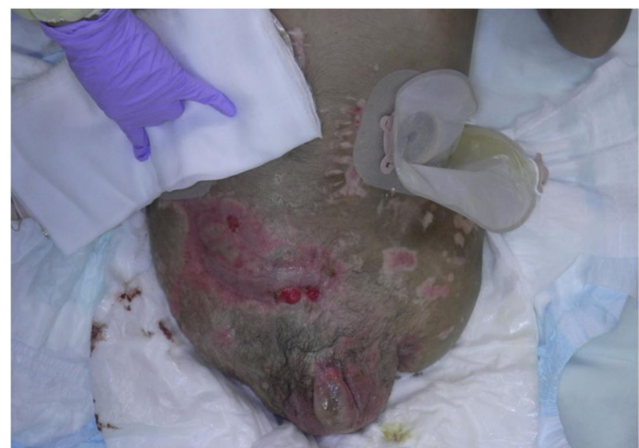
Fig. 6 In supine position. Epithelialization was achieved

Reconstruction after bilateral partial hemipelvectomy is very important for rehabilitation. The dead space of the pelvis needs to be filled with an adequate amount of soft tissue. A simple skin graft cannot tolerate the shear force and could easily lead to the formation of ulcers. Of the methods that have been reported regarding soft tissue coverage after hemipelvectomy, most involve hemipelvectomy following osteomyelitis or the removal of malignancies [6–8]. In a situation where a tumor in the pelvis is removed, intact skin and muscle can be preserved to some extent, and the choice of a free flap from the ipsilateral leg could also be considered. Besides the traditional posterior gluteus maximus flap or anterior quadriceps flap reconstruction after hemipelvectomy, Senchenkov et al. reported that the rectus abdominis