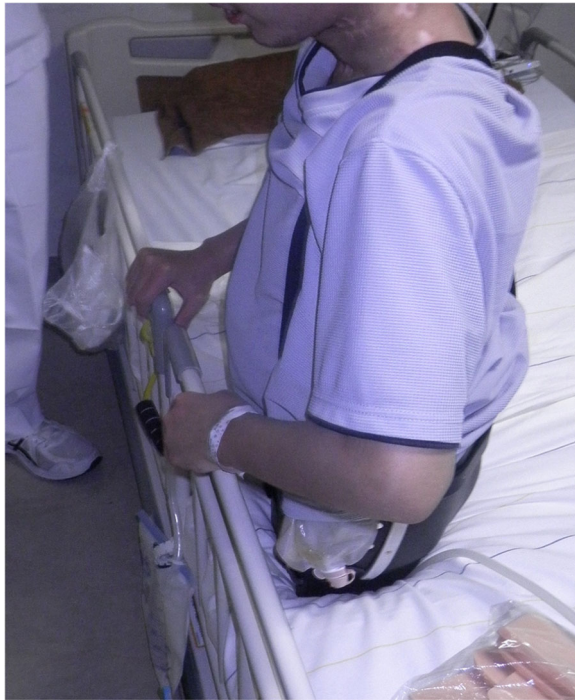
Fig. 7 Rehabilitation was started along with the use of prosthetics