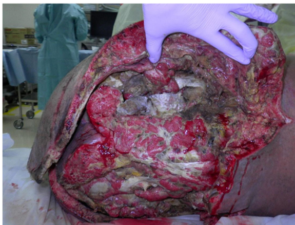
Fig. 1 Before the debridement

Pelvic fracture in general is a catastrophic injury with a mortality rate of 40% and this percentage rises to 60 to 100% in patients with TH [3, 5]. Immediate management of the hemorrhage is the top priority. In this case, immediately after hemostatic resuscitation was performed, angiography was performed for TAE to control the continuous hemorrhage, and the bilateral internal iliac arteries were embolized. TAE has been shown to be useful for controlling arterial hemorrhage and is often successfully performed for hemorrhage control in cases of pelvic fracture. In this case, the hemorrhage was also due to injury of the right external iliac artery, which was