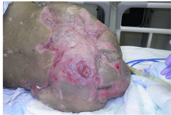
Fig. 5 In lateral position. Epithelialization was achieved

underestimated since it is very difficult to differentiate between viable and nonviable tissue. Gelatin sponge, which was used for embolization of his bilateral internal iliac arteries, was reperfused 2 or 3 days after embolization and the blood supply was maintained. This could also explain why tissue and skin that appeared to be viable during debridement often turned necrotic several days later.