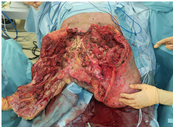
Fig. 3 Left anterolateral thigh flap was preserved after several debridements

successfully treated by ligation. In parallel with the increasing number of TAE procedures performed for pelvic fracture, there has been an increase in the number of complications caused by TAE of the internal iliac artery, including gluteal skin and muscle necrosis, dysfunction of the bladder and rectum, and sexual dysfunction. Our patient was referred to our plastic surgery department due to the presence of blisters on his bilateral thighs and scrotum, which were thought to be complications caused by TAE of the bilateral internal arteries. These blisters were evident at our first consultation. In addition, his limbs were pale and contrast CT showed ischemia of his lower limbs. Rapid amputation of his bilateral limbs was inevitable to prevent the progression of necrosis and infection. The bilateral limbs were amputated in separate procedures because the amount of blood lost in each operation could have easily exceeded 2000 ml and our patient could not have tolerated such a prolonged surgery. We needed to perform several debridement procedures because of the massive hemorrhage, which placed a tremendous burden on our patient; the amount of nonviable tissue that needs to be debrided tends to be