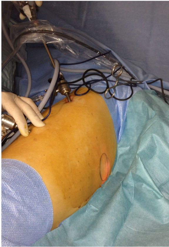
Fig. 2 Patient position for right chest thoracoscopy

ICILH can be silent and undiscovered during a clinical examination or it can show symptoms if the size is big [6]. When small, the physician can be oriented by the parents who will mention a nodular mass occurring during coughing. In this context, the Valsalva maneuver, as we experienced in this case, can be help in highlighting the tumefaction [12].