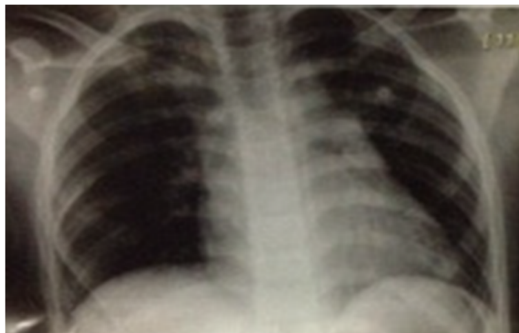
Fig. 1 Standard X-ray of the chest (normal)

Our case report is the second case of ICILH in the literature. Information from a clinical examination was sufficient to make the diagnosis of intercostal lung hernia.