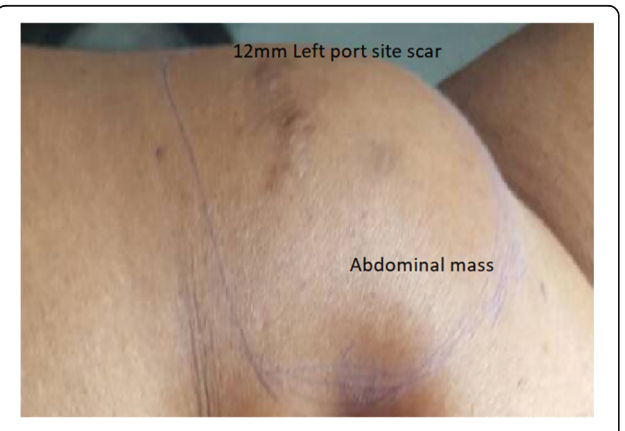
Fig. 1 Lower anterior abdominal wall mass at the previous left laparoscopic myomectomy port site

Her preoperative work-up included a pelvic ultrasound examination, which revealed multiple intramural fibroids with a superficial left hypoechoic mass in the left iliac fossa region measuring 4 cm by 3 cm. Abdominopelvic magnetic resonance imaging (MRI) revealed an anterior abdominal mass measuring 7.2 cm by 5.1 cm by 3.4 cm on the anterior abdominal wall in the left iliac fossa (Fig. 2). A full hemogram revealed a hemoglobin level of