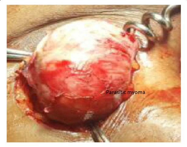
Fig. 3 Parasitic myoma at the previous 12-mm left laparoscopy port site before excision

Treatment involves excision of the parasitic myoma. This would be achieved through laparoscopy with good outcomes or through laparotomy, especially in cases of large myomas or suspected malignancy. In our patient, excision was performed through a laparotomy. Whenever possible, a multidisciplinary approach should be used, especially when the parasitic myoma is near other organs [10]. This was not necessary in our patient, however, because the myoma was on the anterior abdominal wall.