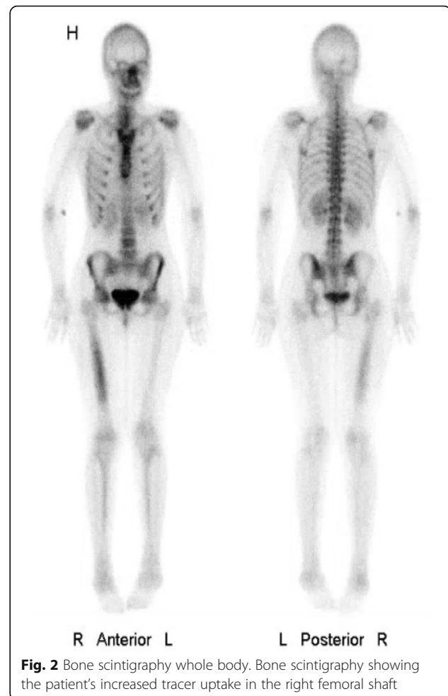
Fig. 2 Bone scintigraphy whole body. Bone scintigraphy showing the patient's increased tracer uptake in the right femoral shaft

A bone biopsy was performed and showed thickened bone spines with preserved lamellar structure and slightly accentuated cement lines. There was no fibrosis, inflammation, or increased alcian positivity, which would be suggestive of active osteomyelitis. There were no signs of malignancy or neoplasia.