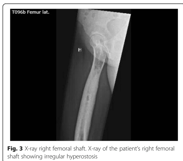
Fig. 3 X-ray right femoral shaft. X-ray of the patient's right femoral shaft showing irregular hyperostosis

In this case report, pain is the only symptom. In other studies of melorheostosis, pain has also been found to be the most prevalent symptom [3]. Melorheostosis can be monostotic or polyostotic and the lower limbs are most often affected [3, 16], in some cases causing a difference in limb length. Associated findings have been reported to be