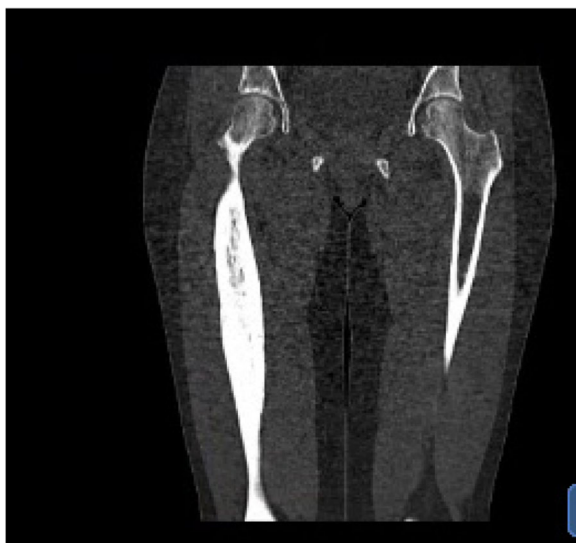
Fig. 1 Computed tomography of right femoral shaft. Computed tomography scan showing cortical thickening of the patient's right femoral shaft

Screening for the GNAS1 activating mutation R201 was negative in peripheral blood; as was mutation screening of the SQSTM1 gene, which has been reported to be mutated in Paget's disease of bone.