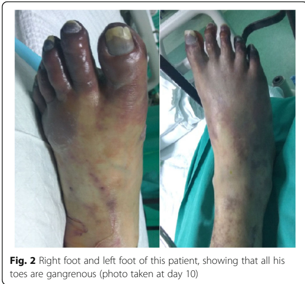
Fig. 2 Right foot and left foot of this patient, showing that all his toes are gangrenous (photo taken at day 10)

to measure these natural anticoagulant factors in our hospital in Malaysia). Further depletion of protein C has been reported to occur in the setting of polytrauma [13].