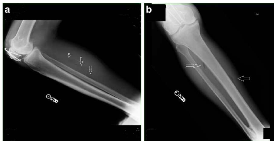
Fig. 2 a Subcutaneous emphysema of the deep posterior compartment of the right lower extremity. b Subcutaneous emphysema of the deep posterior compartment of the right lower extremity

All surgical samples were collected using an eSwab Transport System (CoPan Diagnostics Inc., Murrieta, CA, USA), which handles all aerobic, anaerobic, and fastidious microorganisms. Blood cultures were placed in designated aerobic and anaerobic blood culture bottles (BacT/ALERT, Durham, NC, USA). The clinical laboratory at Saint Anthony Hospital outsources its microbiology to another laboratory in the Chicago area (LabCorp, 321 W Lake Street Suite C, Elmhurst IL, 60126). After samples are received from the operating room, they are packaged as per LabCorp specifications, and a courier is summoned. The estimated travel time is less than 4 hours. For surgical samples two different media cultures are used: for aerobic samples the swab containing the specimen is immersed in a gel-based transfer media; for anaerobic samples the Port-A-Cul transport system (BD – Beckton Dickinson, Franklin Lakes, NJ, USA) is used. Once the samples arrive at LabCorp they are processed as per proprietary procedures. Anaerobes in this sample were identified using RapID-ANA Kit (Thermo Fisher Scientific, Waltham, MA, USA). In addition, LabCorp results confirmed the presence of beta-hemolysis in the cultured plates.