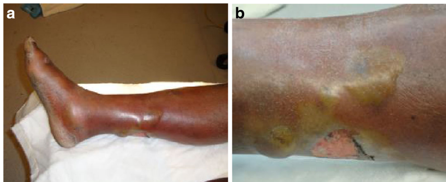
Fig. 1 a Right lower extremity with multiple serous-filled bullae and a superficial ulceration. b Right lower extremity with multiple serous-filled bullae and a superficial ulceration

He was started on broad spectrum antibiotics (vancomycin and piperacillin/tazobactam) and was taken to the operating room, where he underwent a four-compartment fasciotomy of his right lower extremity with extensive debridement of necrotic fascia and muscle. A medial incision was made from a point distal to the tibial plateau and