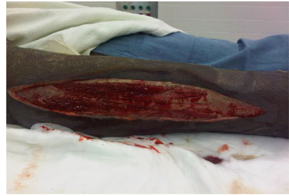
Fig. 4 Granulation tissue covering the base of the wound after multiple debridements

Initial Gram stains of the pus collected showed only rare WBCs and no microorganisms. Blood cultures taken prior to surgical intervention (both bottles) and cultures from his right lower extremity wounds following the initial fasciotomy demonstrated Fusobacterium necrophorum , which was beta-lactamase negative and sensitive to cefoxitin, chloramphenicol, clindamycin, penicillin, doripenem, and metronidazole (determined by broth microdilution). No additional microorganisms were identified. The sputum cultures showed no growth.