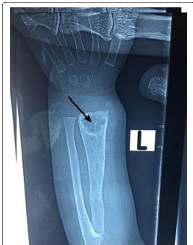
Fig. 1 A well-defined metaphyseal lytic lesion with partially sclerotic margin compatible with osteitis (arrow)

treatment (isoniazid, rifampicin, and ethambutol). She showed gradual improvement, the swelling subsided, and the wound healed completely; she received the anti-tuberculous treatment for 1 year. At follow-up visits, she used her left forearm normally with full range of movement (Fig. 3). A repeat X-ray showed complete healing (Fig. 4)