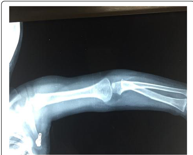
Fig. 4 A follow-up X-ray with complete disappearance of the lytic lesion