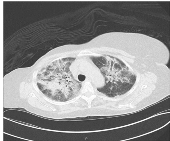
Fig. 2 Patient's chest computed tomography on admission