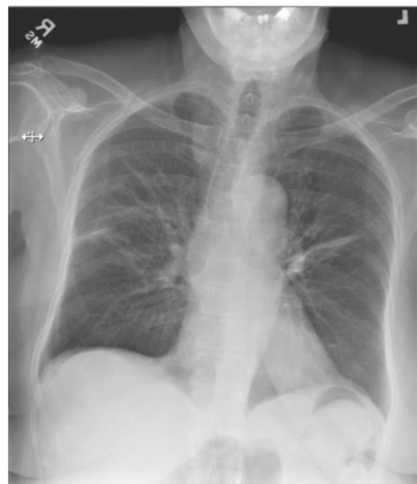
Fig. 3 Patient's chest X-ray after stopping methotrexate and starting steroids

The variable incidence and usual occurrence within a year of starting MTX suggests that pneumonitis is an idiosyncratic immune reaction rather than a dose-related toxic insult to the lung [1, 2]. A review of the literature shows that there are some risk factors that increase the incidence of MTX-induced lung toxicity, including age