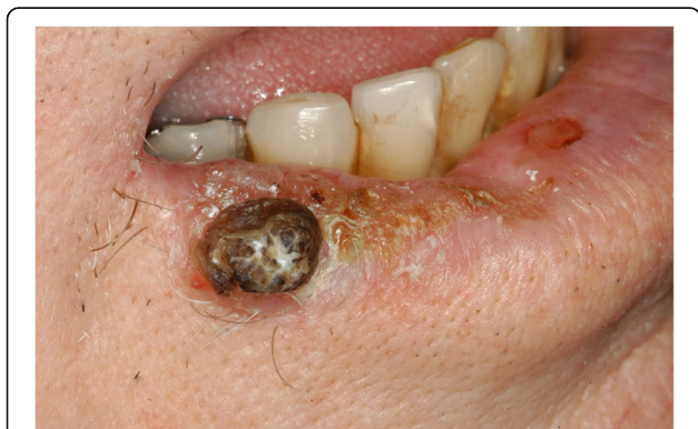
Fig. 1 Affection in the right lower lip. This finding initially led the patient to consult a specialist and finally this was the reason inverted papilloma could be diagnosed by magnetic resonance imaging

A clinical examination revealed no abnormalities other than a firm mass on the right side of his lower lip (Fig. 1), without palpable cervical lymphadenopathy. Because squamous cell carcinoma of the lower lip was suspected, he was scheduled for contrast-enhanced magnetic resonance imaging (MRI) of his head and neck area. The MRI showed next to a tumorous contrast-affine process of approximately 1.2 cm in diameter on his right lower lip, a 3×2 cm 2 polycyclic arranged mucosal thickening with cystic and solid contrast affine shares at the antral laterocaudal area of his right maxillary sinus, extending from his right lateral nasal wall to maxillary sinus floor. There was no evidence of bony erosion or other cervicofacial