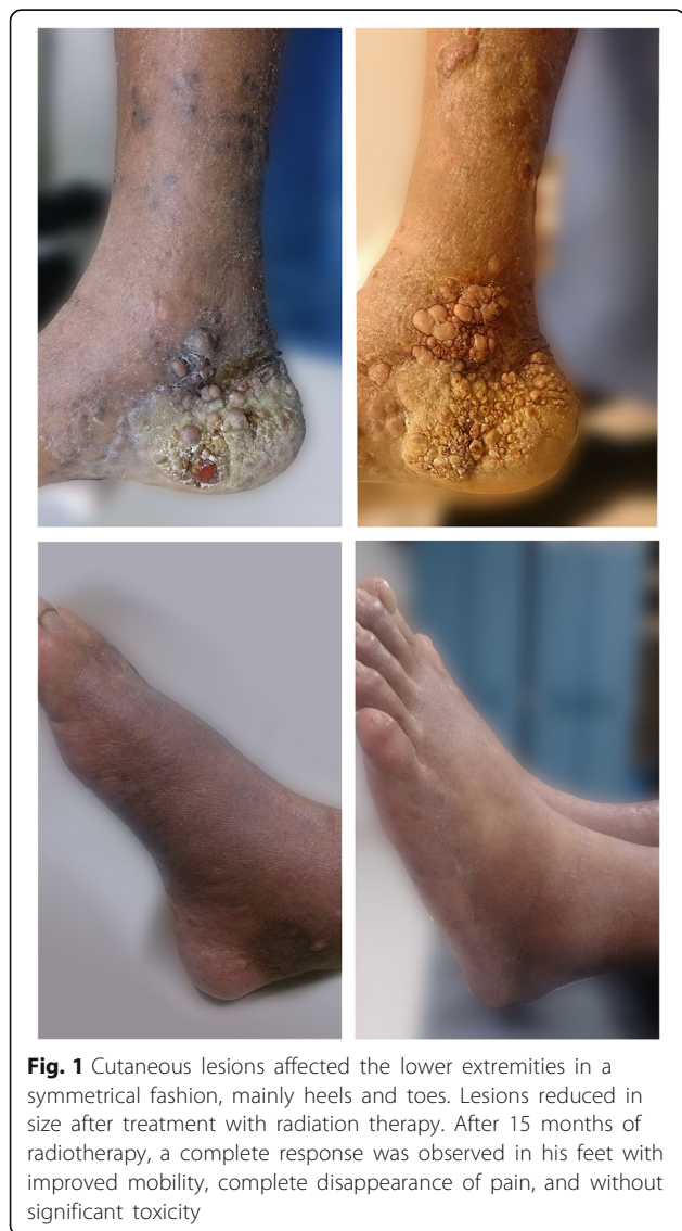
Fig. 1 Cutaneous lesions affected the lower extremities in a symmetrical fashion, mainly heels and toes. Lesions reduced in size after treatment with radiation therapy. After 15 months of radiotherapy, a complete response was observed in his feet with improved mobility, complete disappearance of pain, and without significant toxicity

his legs and ulcerated lesions on his feet, limiting our patient’s ambulation for a year (Fig. 1). In order to confirm the diagnosis of CKS, an incisional biopsy was performed on our patient; the result was non-HIV-associated CKS without immunosuppression (Fig. 2). The final diagnosis was: dispersed and aggressive stage IV CKS. Our patient was not a candidate for systemic therapy due to the comorbidities and the high toxicity risk. Radiotherapy was decided as the single treatment with the Clinac iX energy 6MV equipment (Varian Medical Systems, Inc., Palo Alto, CA, USA), using two fields of treatment and 100 % of the prescription dose, giving a total dose of 3000 cGy in 15 fractions, 200 cGy per fraction, and a bolus of 0.5 cm doses to the surface. An increase in electrons for his heels with a 0.5 cm depth from the skin was considered (Fig. 3).