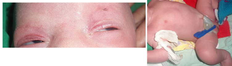
Fig. 1 Alopecia universalis. No hair on entire body except for three to four strands of fine hair on the left eyebrow

HD is a developmental disorder with multiple genetic causes and etiologic mechanisms. Mutations in a variety of genes may be responsible for its heterogenous nature. The most common gene identified is the RET proto-