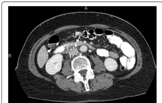
Fig. 1 Computed tomography scan Abdomen (axial) showing struts of filter extending to adjacent structures after penetrating the wall of inferior vena cava. Arrow pointing to one of the anterior struts of inferior vena cava filter penetrating the duodenum

Permanent filters cannot be removed or repositioned. Retrieval of the temporary IVC filter is often straightforward and can be done with a high degree of success, ranging from 93 % to 100 % [5, 6]. Removal within 30 days is typical, but successful filter removal more than 1 year after implant has been reported. Kwok et al. described a