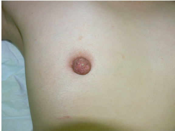
Fig. 1 Appearance of the right nipple. The right nipple felt firm, but no mass was palpated. A milky secretion was noted. Our patient did not complain of pain, itching, or ulceration

composed focally of ducts and tubules lined by a double layer of epithelial cells; the outer layer comprised small, cuboidal cells with scanty cytoplasm, while the inner layer consisted of rather flat cells with eosinophilic cytoplasm and centrally located small nuclei (Fig. 3). Many of the proliferating ducts assumed a teardrop or comma-shaped configuration. In addition, squamoid solid nests were found scattered among them, and the tumor cells