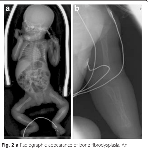
important cardiomegaly is also observed. b Diaphyseal fracture of the ulna. In McCune–Albright syndrome fractures occur as a result of osteopenia associated with cortical thinning

Otherwise, her liver function test levels remained high (AST 709U/L, normal <34U/L; ALT 1656U/L, normal 12 to 78U/L; \gamma GT 1541UI/L, normal <38UI/L; total bilirubin 7.65mg/dL, normal <1mg/dL; conjugated bilirubin 6.77mg/dL, normal <0.3mg/dL; total cholesterol 534mg/dL, normal <190mg/dL; triglycerides 198U/L mg/dL, normal <150mg/dL). A trial of phenobarbital and ursodeoxycholic acid was initiated in an effort to stimulate bile flow, but jaundice persisted.