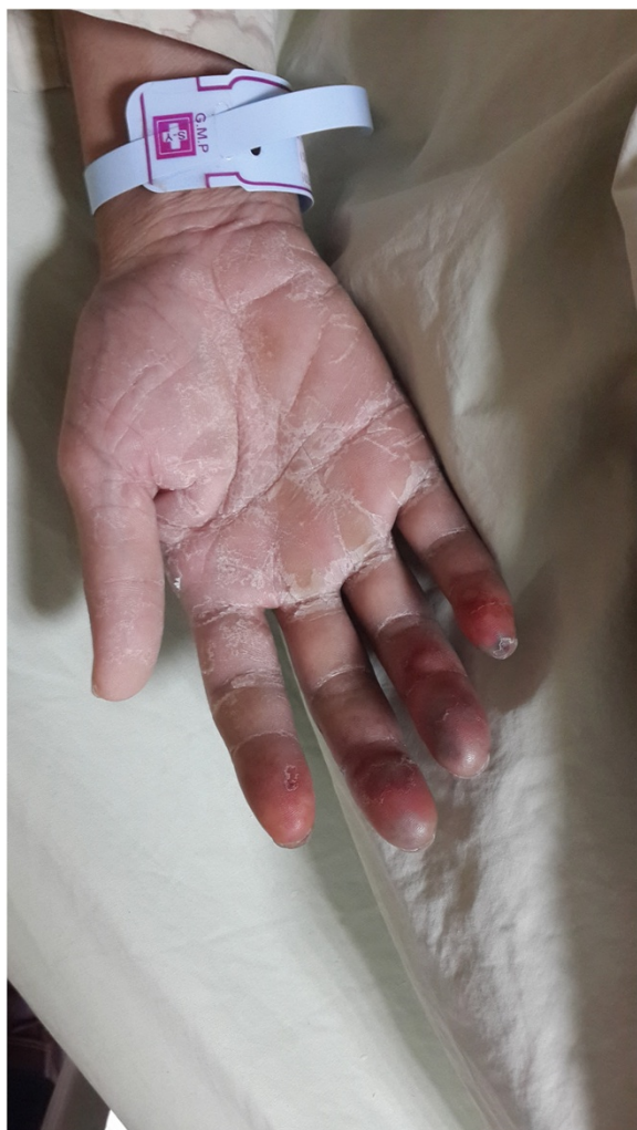
Fig. 1 Acrocyanosis on day 9 after admission

pulses were palpable in both the upper and lower extremities. The results of laboratory tests for SPG, comprising infection, malignancy, and the autoimmune system, were unremarkable (Table 1). Transesophageal echocardiography, carotid Doppler ultrasound, and sonography of the upper extremity vessels also were unremarkable. The patient was administered two doses of oral aspirin 75mg/day and two doses of oral pentoxifylline 400mg/day for 20 days. Because of upper GI tract bleeding noted on admission, heparin was not considered. The gangrenous lesion was kept warm and was not touched, as much as possible. The patient's condition improved steadily over the next 7 days. His pain decreased, and his range of motion improved. Gradual desquamation of his finger skin occurred, with shedding of gangrenous scabs from the tips of his fingers and complete resolution (Fig. 2a, b). The patient was discharged from the hospital stay 26 days later. The patient responded well to the treatment and returned to his normal daily activities during outpatient follow-up.