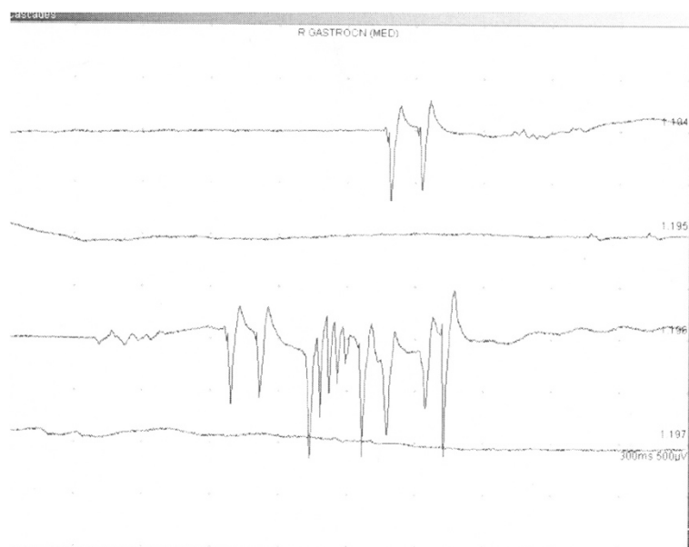
Figure 1 Neuromyotonic discharge in musculus gastrocnemius medialis; right.

For a period of 5 days, immunoglobulin was applied intravenously at a dosage of 0.4g/kg body weight. A rapid improvement in his muscle strength occurred, his fasciculations decreased, and his pain sensation disorders were alleviated, including hyperalgesia. Subsequently, venlafaxine 150mg, carbamazepine 2×200mg, and mirtazapine 30mg each night were prescribed. Both his sleep disorder and daytime fatigue were alleviated. A follow-up EMG showed an increased A-sensory nerve action potential and shortened duration of afterdischarges. His blood CK level decreased to 2.31nkat/L. He was discharged after 14 days. A follow-up examination confirmed stable state; he had no sleep disorder, hallucinations or depression.