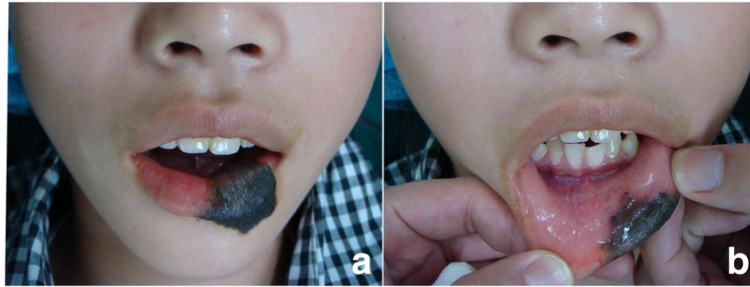
Figure 1 Preoperative view of lesion. a. the external surface. b. the inner surface.