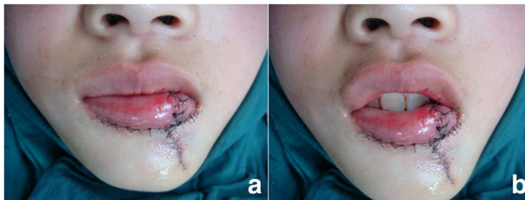
Figure 3 Immediately after the operation. a. the view of closed position of mouth. b. the view of opening position of mouth.

Ebrahimi et al. [7] believed that in patients with a defect of 30 to 50% in size, and if the defect was located in central-lateral part of lower lip, a reversed Abbe flap from the upper lip and a step-ladder flap should be used. In patients with a defect of 50 to 80% in size, a bilateral Karapandzic flap and double reversed Abbe flap should be used. Roldán et al. [8] believed that a defect involving less than one third of the lip could be closed primarily after wedge excision. If the defect was up to two thirds of the lip in size, the Webster method, step technique, or such techniques combined with a cuneiform Abbe flap could be used for reconstruction of the lower lip.