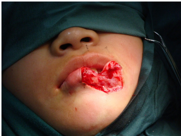
Figure 2 Intraoperative view of the lesion.

allow for a more aggressive resection, due to the significant displacement of the adjacent normal tissue, with less postoperative distortion than would traditionally be expected for nevi or malignancies [6].