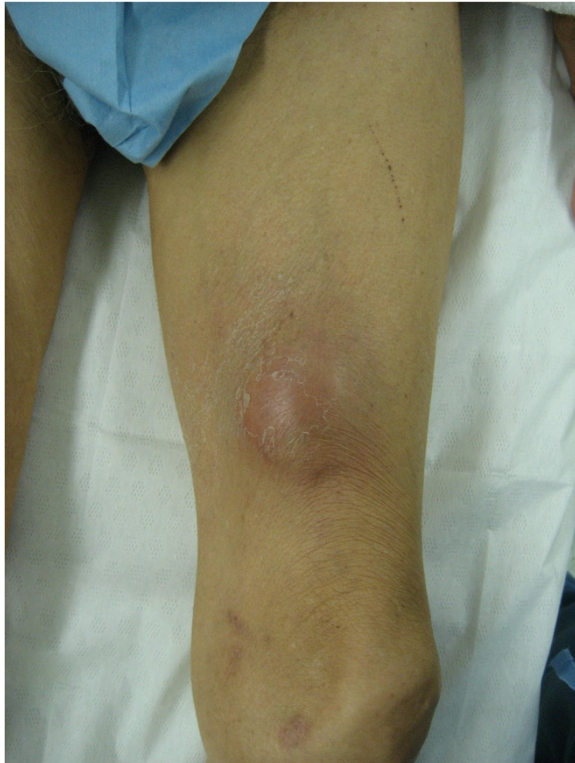
Figure 1 The tumor was elastic and soft with a relatively clear border, and located in the medial aspect of the left thigh.

imaging (MRI) scans revealed two soft-tissue tumors in the intramuscular layer between the vastus medialis muscle and the adductor muscle (Figure 2A). Extensive peritumoral inflammatory edema was obvious. T1-weighted axial imaging of the distal tumor (size, 4.0×4.0×3.5cm, Figure 2B) revealed homogeneous low signal intensity, whereas T2-weighted axial imaging (Figure 2C) revealed heterogeneous low and high combined intensities. The proximal tumor (size, 2.0×2.0×1.5cm), located 9cm proximal to the distal tumor, had the same intensity on the MRI scan (Figure 2A). Laboratory investigation showed an increased white blood cell count ( 10.9 \times 10^9 cells/L: neutrophils, 80%; lymphocytes, 18%; and monocytes 6%), erythrocyte sedimentation rate (100mm/h; normal value, <20mm/h), and C-reactive protein concentration (10.0mg/dL; normal value, <0.30ml/dL). Other biochemical and serologic parameters, including the lactate dehydrogenase level, were normal. As the results of physical and radiological examinations were highly suggestive of abscess formation, we prescribed antibiotics for two weeks. However, our patient's symptoms did not improve. For pathological examination, we performed an open biopsy. Histological examination of the biopsy sample showed dense infiltration of large, atypical, pleomorphic spindle cells with prominent nucleoli and mitotic figures (Figure 3A, hematoxylin and eosin (H&E) stain, ×40).