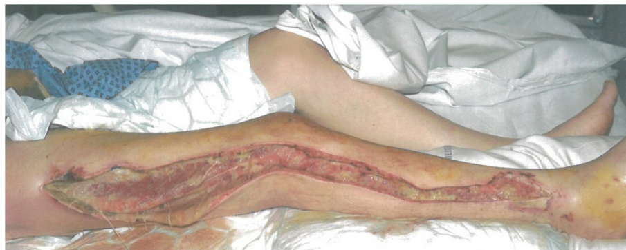
Figure 2 This picture demonstrates the extensive debridement necessary to remove infection from the tracking abscess.

Three weeks after he was discharged from his initial admission he returned for a right hemicolectomy and defunctioning ileostomy, rather than a primary anastomosis given his poor nutritional state and recurrent lower limb wound infections. The histology confirmed