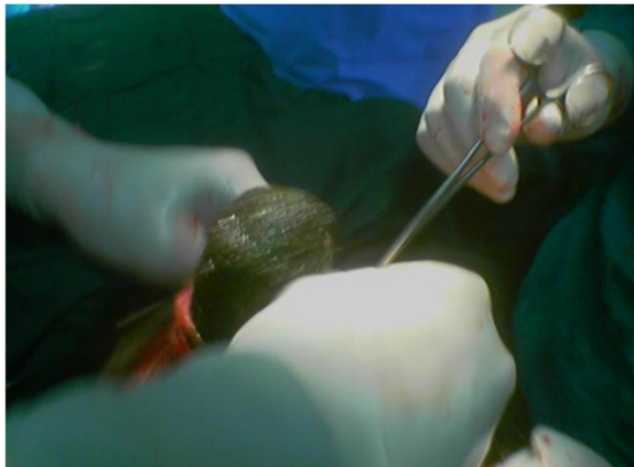
Figure 3 Removal of the trichobezoar from the stomach.

tomography scan facilities in our emergency department to diagnose the case pre-operatively, we depended on a high index of suspicion in the management of our patient. We performed an explorative laparotomy as an emergency operation to save our patient's life.