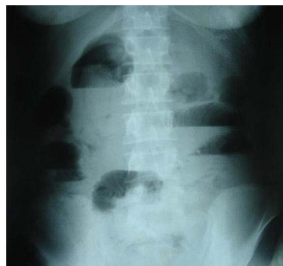
Figure 2 Upright plain abdominal X-ray demonstrating a small bowel obstruction. Note the presence of multiple air fluid levels.

Although rare, a trichobezoar may present as an emergency that requires proper preparation by the surgeons. Due to the unavailability of endoscopy and computed