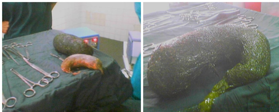
Figure 4 Removal of trichobezoar revealed two masses taking the shape of the stomach and ileum.

In one study, a laparoscopy was used for the initial procedure but then converted into a laparotomy when difficulties were encountered as a result of a large intra-gastric mass. In some centers, laparoscopy is considered inferior to laparotomy for the treatment of a trichobezoar. Nirasawa et al. [10] were the first to report on laparoscopic removal of a trichobezoar. Since then, only six other reports of attempted laparoscopic removal have been published [7-9,11-13]. The lack of reports on endoscopic treatment might partly be explained by the rarity