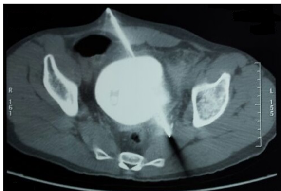
Figure 2 Excretory phase computed tomographic scan showing lesions of the bladder and the left ureter.

1000mL of widely dispersed fluid was observed in the abdominal cavity. During the exploration of the bladder, two centimetric intrabla dder breaches and a breach on the left pelvic ureter were found without other associated lesions. These breaches were repaired by surgical suture, and a ureteral catheter was mounted. The incision was closed primarily in two layers, and a urinary catheter was placed. No problems were encountered during the patient's peri-operative clinical course. The patient received psychiatric care, and his post-operative follow-up was unremarkable.