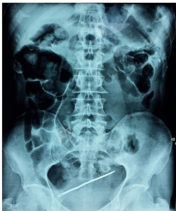
Figure 1 X-ray of the patient revealing a sewing needle projecting into the bladder area.

1000mL of widely dispersed fluid was observed in the abdominal cavity. During the exploration of the bladder, two centimetric intrabla dder breaches and a breach on the left pelvic ureter were found without other associated lesions. These breaches were repaired by surgical suture, and a ureteral catheter was mounted. The incision was closed primarily in two layers, and a urinary catheter was placed. No problems were encountered during the patient's peri-operative clinical course. The patient received psychiatric care, and his post-operative follow-up was unremarkable.