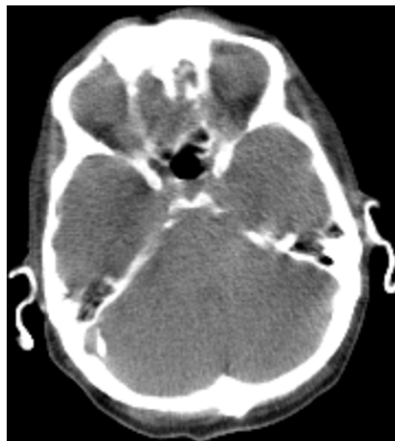
Figure 1 Computed tomography scan of the cerebrum displayed fully calcified auricles.

Calcification of the auricles is described in many forms and multiple terms are used for this heterogeneous