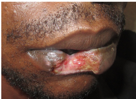
Figure 1 Clinical image: A human bite injury. Notice the severe lip tissue defect mimicking an ulcerative chronic process.