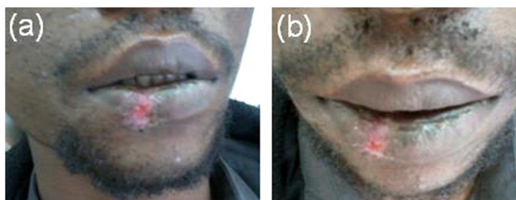
Figure 3 Postoperative images. (a) and (b). After removing sutures.

The current practice emphasizes that thorough irrigation of contaminated bite wounds would considerably decrease the bacterial load, remove particulate matter and reduce infection rate. Irrigation techniques range from manual irrigation using a 20 to 35mL syringe (18 to 20G needle) to pulsatile jet lavage (pressure of 50 to 70psi). Normal saline is the preferred irrigant as it does not interfere with the normal wound healing as most antiseptics do [3].