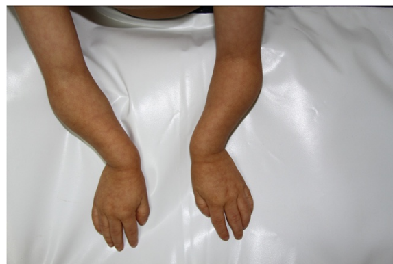
Figure 1 Our patient at age 5. Note the ulnar deviation of his hands.

The growth of an individual depends on the regulation of cell division and cell growth. Alterations in either of these regulatory pathways result in sub-somatic growth and