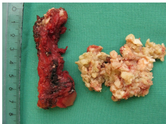
Figure 3 Retro-rectal cystic hamartoma.