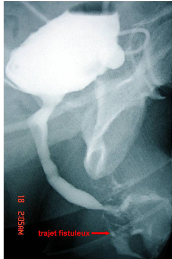
Figure 2 Urinary retrograde and voiding urethrocytography shows an anterior narrowing of the urethra with infiltration of the contrast agent in the sinus trajectory.

The evolution was marked by delayed wound healing associated with the persistence of fistulas extending into the corpus cavernosum with purulent discharge. It was at this point of the treatment that we suspected TB and we carried out a biological assessment in this regard. His test result for Koch bacillus (BK) in the urine was negative. His tuberculin assessment result was positive. Multiple