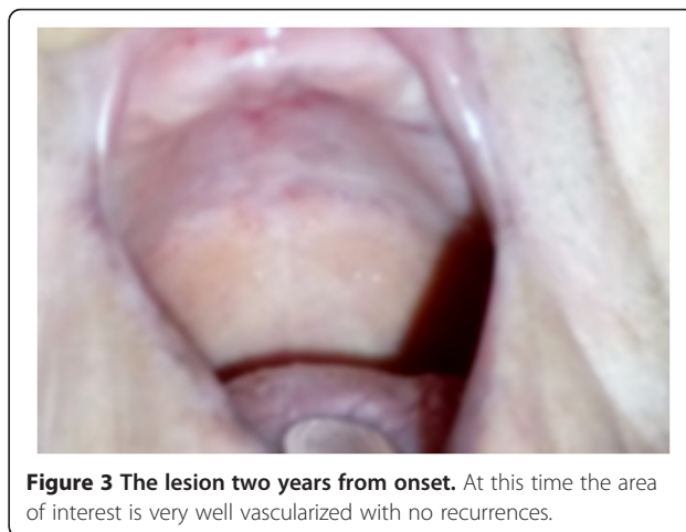
Figure 3 The lesion two years from onset. At this time the area of interest is very well vascularized with no recurrences.