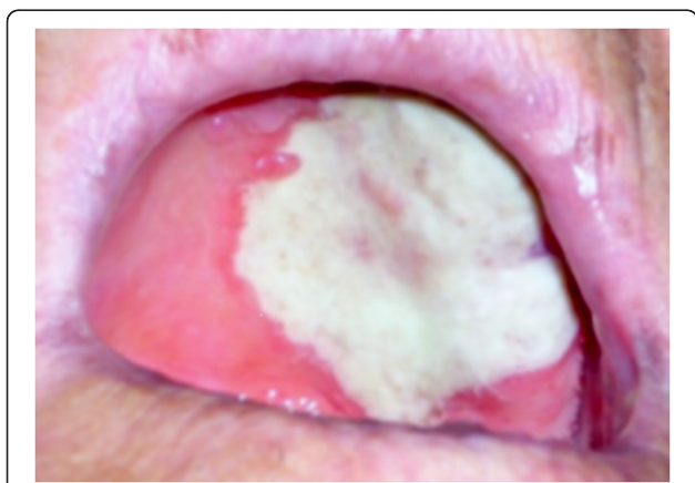
Figure 1 Palatal lesion at presentation. On clinical examination, the affected area showed a well demarcated, fibrinous border, corresponding to the vascular zone affected by necrosis.

Patients with PAN may present with various symptoms related to vascular involvement within a specific organ. Our patient's case illustrates a rare and interesting manifestation of PAN with involvement of the hard palate. The authors do not know if the appearance of vasculitis