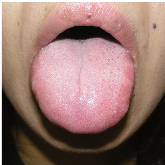
Figure 3 Representative photograph of the tongue 7 years postoperatively. The taste buds can be observed on the surface of the regenerated (right) side of the tongue, but their sizes and quantity were smaller than those of the healthy (left) side.

sensation exhibited objective recovery changes as measured by electrogustometry and the filter-paper disk method. Delayed recovery and a long period of time were required to reach the normal level compared with somatosensory sensations. Moreover, subjective recovery of taste sensation emerged later than objective recovery. This may be related to a central reorganization mechanism