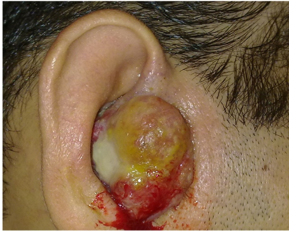
Figure 1 Clinical features of the patient with extramammary Paget's disease.

Magnetic resonance imaging revealed an expansive tumor with imprecise limits and no cleavage plane with the carotid artery. An extension to the parapharyngeal space and an invasion of the middle fossa, associated with meningeal contrast enhancement, were observed (Figure 3b).