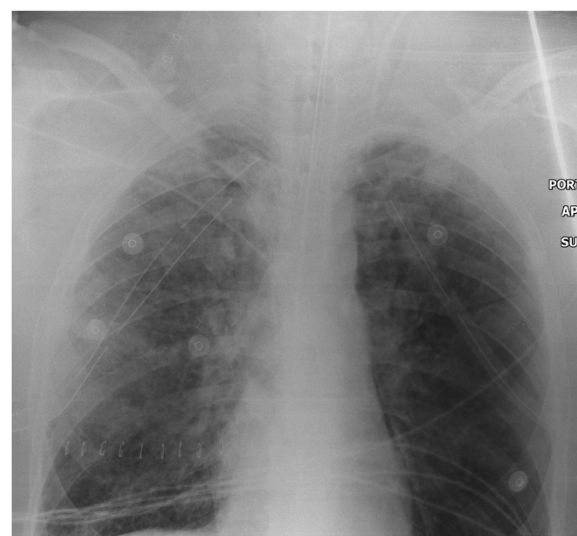
Figure 2 Chest X-ray 48 hours after intensive care unit admission. We see a clear improvement, with decreased bilateral infiltrates, compared with previous X-ray.