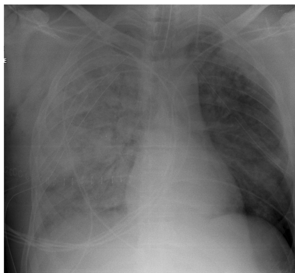
Figure 1 Chest X-ray taken at the admission in the intensive care unit, showing diffuse bilateral lung infiltrates and extensive airspace disease on the right lung.

HFOV has usually been described and used as “rescue therapy” in intractable ARDS with severe hypoxemia, and its use as early ventilatory support for ARDS is not supported by recent clinical trials [7,8]. Despite the description of “early” use (0 to 14 days after injury) of HFOV in trauma patients in retrospective series [4,5], no report of extreme early use has been described.